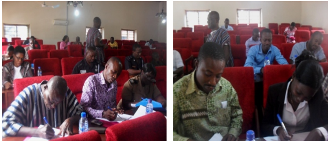
Fig.4: Participants filling the survey questionnaire on critical issues relevant for addressing REDDES

One of the main methodologies agreed for the study was the use of questionnaire to solicit views from participants on a wide range of issues regarding emission reduction from deforestation and forest degradation and improving forest ecosystem services. The next session was therefore used to administer survey questionnaires to participants. The questionnaire was designed to be used by all participating countries, but flexible enough for modifications to meet specific country needs. Information collected generally focused on awareness of forest ecosystem services and their importance, forest and tree tenure arrangements, deforestation and forest degradation and remedial measures, the involvement of various organisations in addressing REDDES, and general practices and measures necessary for maintaining ecosystem services. A sample of questionnaire is found in Appendix 2.