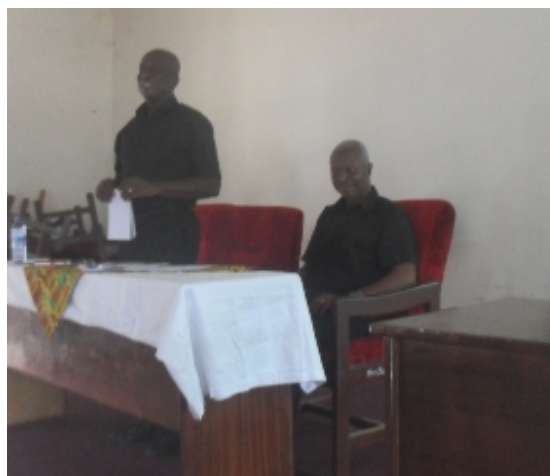
Fig.8: The chair addressing participants with him seated is the MCE for Offinso South Municipality, Hon. Baffour Kesse.