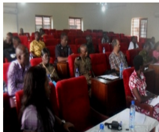
Fig.2: Participants listening to the various presentations